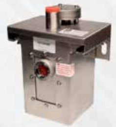
Stainless Steel Breather

Prevent water Contamination in: Flammables Polyurethane Sulfuric Acid Solvents