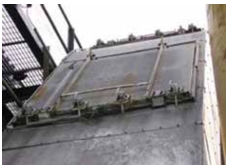
Above: Explosion Door

Standard explosion vents will open at a defined activation pressure and the vent area will remain open - preventing build-up of vacuum pressure on cooling – as such guaranteeing not to fail. Explosion doors will also open at a defined activation point, but will generally re-close after the operation, with a