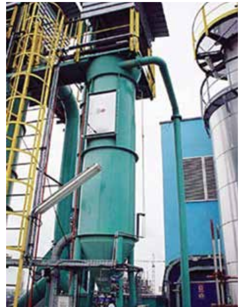
Above: Explosion Vent

Keith added: "Explosion pressure relief is best achieved through the use of devices with no moving parts as they offer the highest venting efficiency and cannot be tampered with. Vents are well known to provide superior process compatibility.